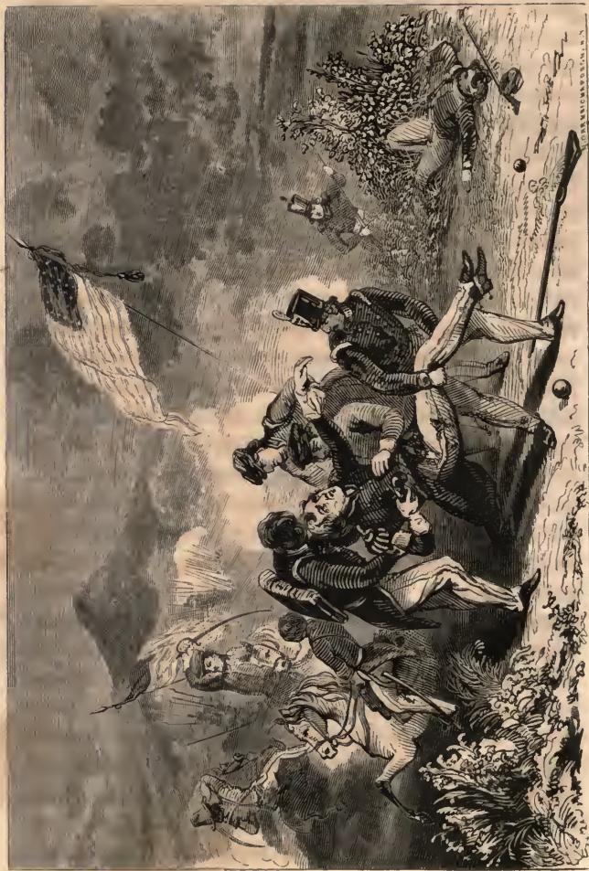
DEATH OF LIEUTENANT COLONEL HENRY CLAY.